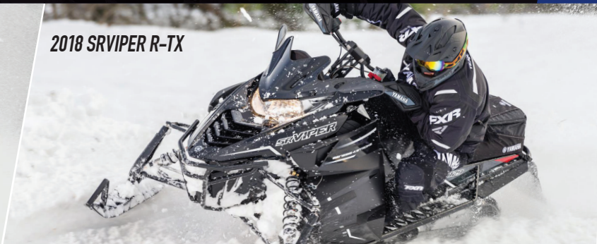
2018 SRVIPER R-TX