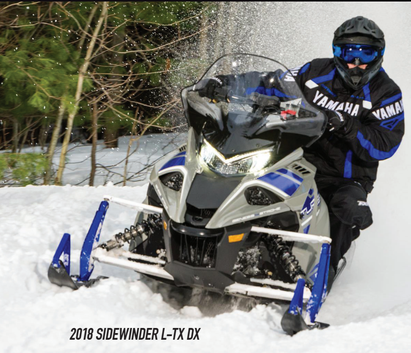
2018 SIDEWINDER L-TX DX