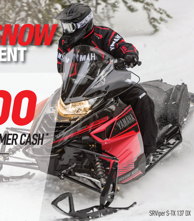
SRViper S-TX 137 DX

Monthly payments required. Valid on amounts financed of $2,500 or more on purchases of new 2012-2016 Apex, 2012-2014 FXNytro & 2014-2016 SRViper models made between 11/1/16 and 12/28/16 on your Yamaha Installment loan account.