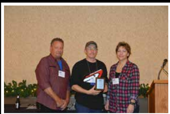
Associate of the Year: Harper Oil