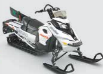
Summit Burton †