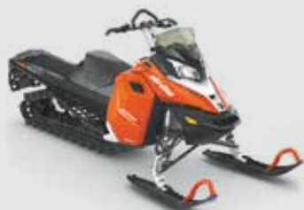
Summit SP with T3 ™ PACKAGE

We are your Ski-Doo experts for sleds, accessories, riding gear and service.